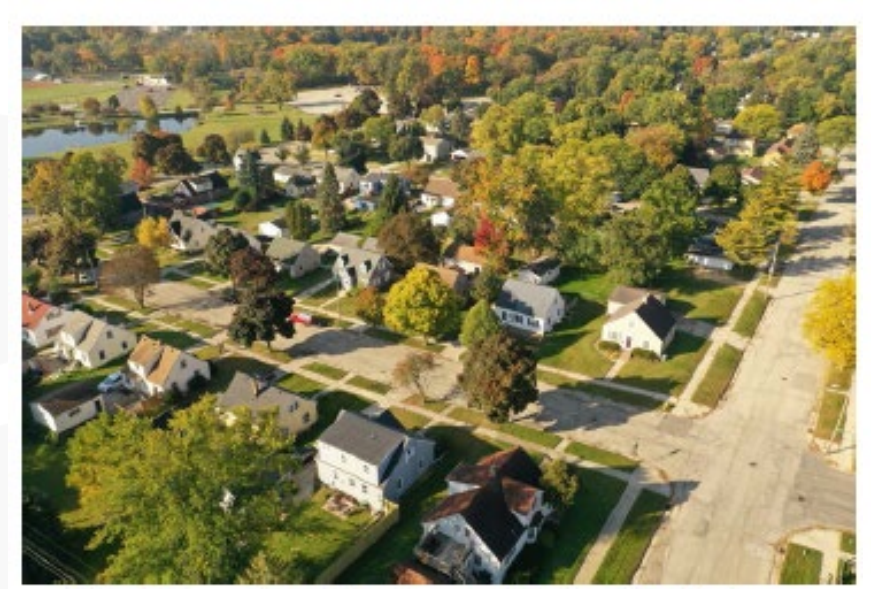
1940 – Parkview Subdivision