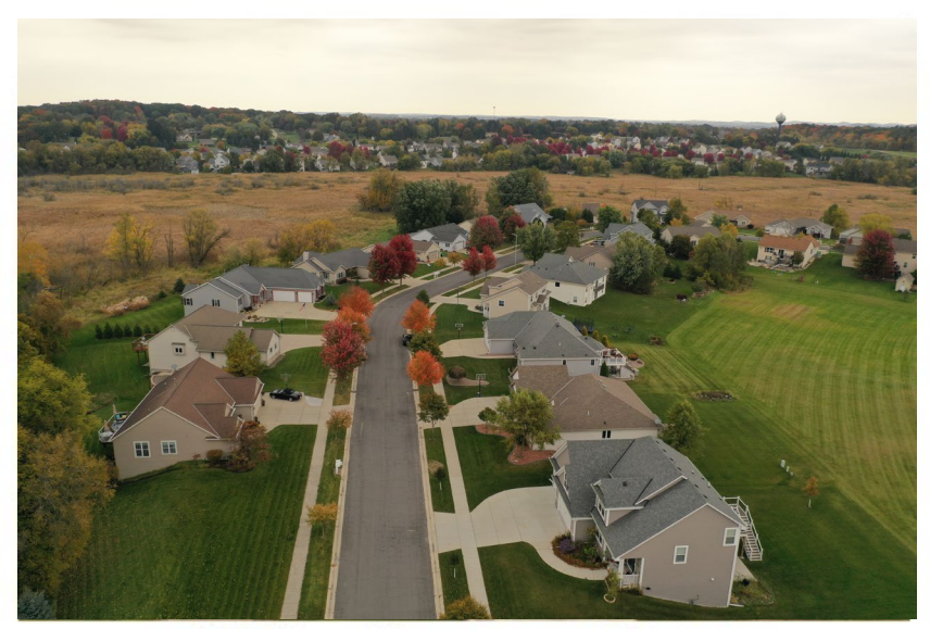
2004 - Summer Wind Subdivision